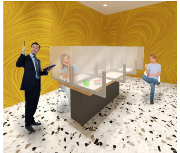
SHARED TABLE PARTITION

The overwhelming majority of products being offered are made simply out of a plexi panel as well as a plexi base. This fabrication is okay for home-office use, but in a real world application, time and time again these products have failed. They are wobbly, weak, and unreliable. In contrast, all our products incorporate aluminum frame and/or base, which provides structure, durability, and a means to safely secure the panel so that it is not a liability.