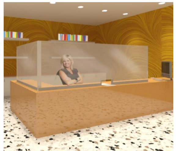
WITH 12w" X 5" OPENING