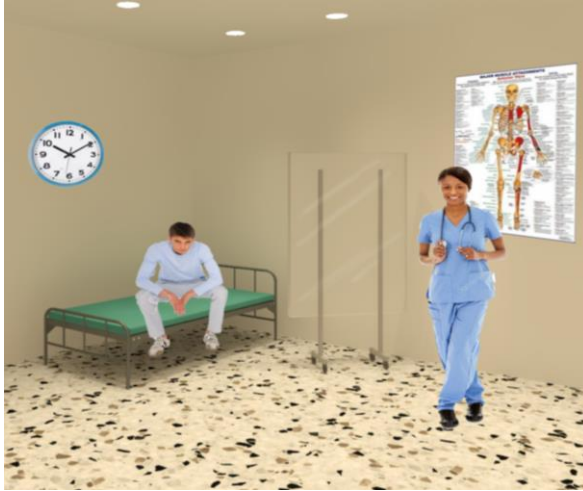
SINGLE MOBILE PANEL