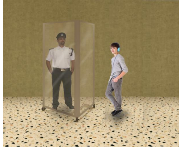
2-SIDED PARTITION PANEL