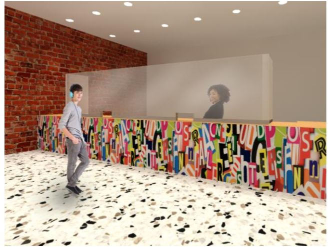
WITH 2 12w" X 5" OPENINGS