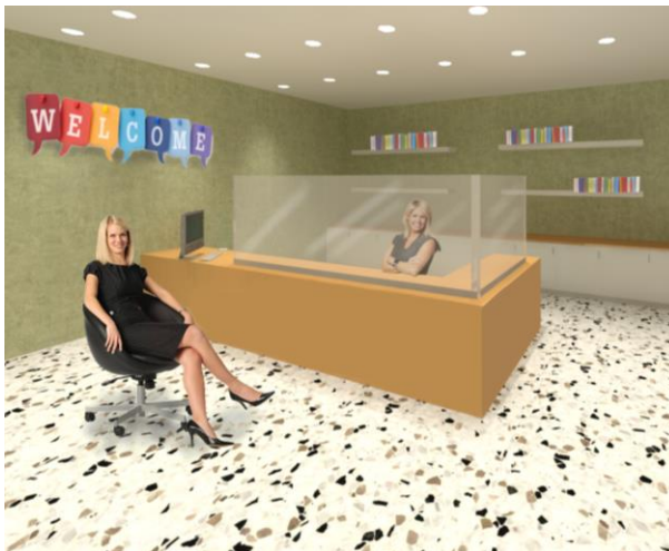
STANDARD OR CUSTOM TO SIZE