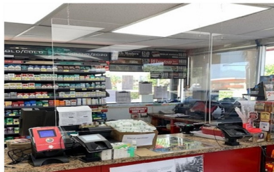
STANDARD PANEL SIZE COMPARISON